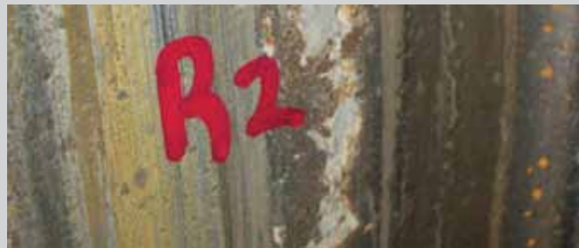
BEFORE: Large surface defect like the one shown on the R2 wheel increases kip-forces, causing track and wheel damage.