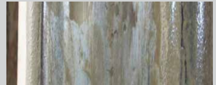
AFTER: During 55 days in service, WheelSaver repaired the tread defect on the R2 wheel.